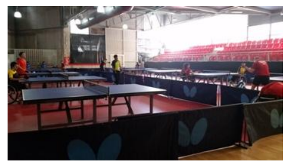
Call Area: close to the practice area and FOP