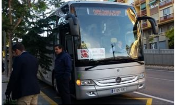
The officials living in the Maya Hotel were brought to the venue by a separate bus.